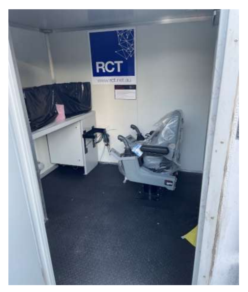
Image 3: New remote control room and associated systems for Kaiser's remote control mining equipment