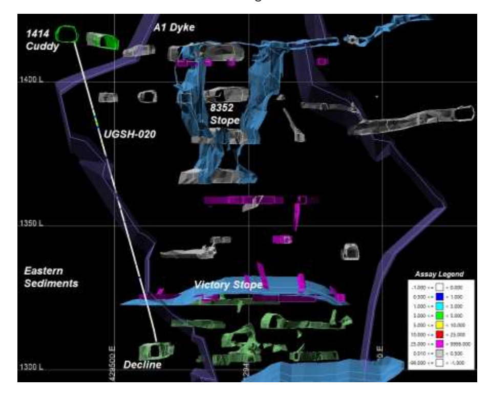
Figure 1: Cross section looking south showing the HV drill hole trace