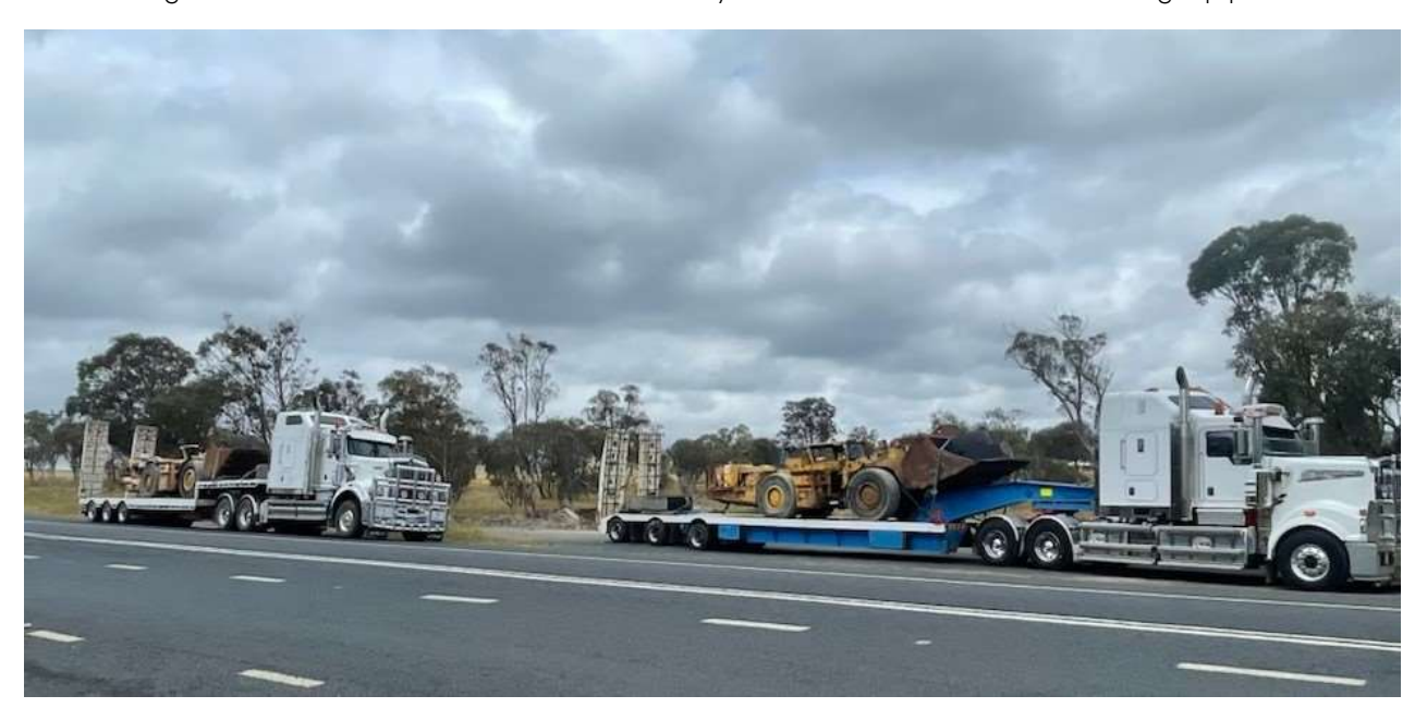
Image 4: Trucks collecting some of the additional new mining fleet (some remote control enabled) to support further production mining rate improvements