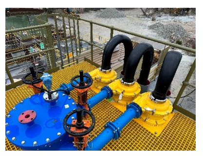
Figure 8. Old Hydrocyclones