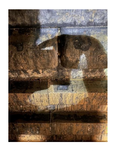
Figure 4. New and Old mill liners

The third stage of the project involved a significant Electrical Engineering project to replace the obsolete PLC's, that were originally installed in the mid 1980's. This project was completed in conjunction with MIPAC, who completed the reverse engineering of the old PLC logic, created the new programs for the new PLC, completed all procurement on our behalf and supported commissioning. The physical installation, design reviews and commissioning was completed by the Maldon Processing team with support from the MIPAC engineers.