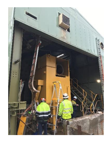
Figure 2. New SAG discharge hopper

The second stage was the redesign of the SAG Mill lining system. The was done in conjunction with our liner supplier Growth Steel, who used their significant experience and design techniques to create a design, that improved wear life of the liners, increased the grinding efficiency of the mill and significantly reduced gold hold up between and behind the liners (Figures 3 & 4). This was completed in April 2023.