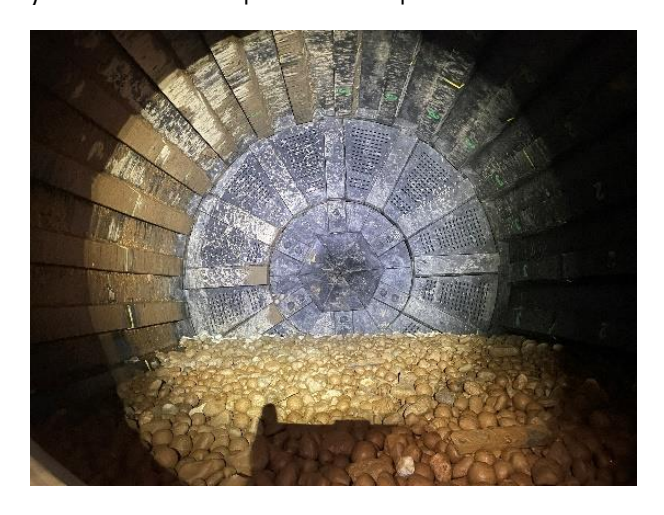
Figure 3. New Mill liners installed

The second stage was the redesign of the SAG Mill lining system. The was done in conjunction with our liner supplier Growth Steel, who used their significant experience and design techniques to create a design, that improved wear life of the liners, increased the grinding efficiency of the mill and significantly reduced gold hold up between and behind the liners (Figures 3 & 4). This was completed in April 2023.