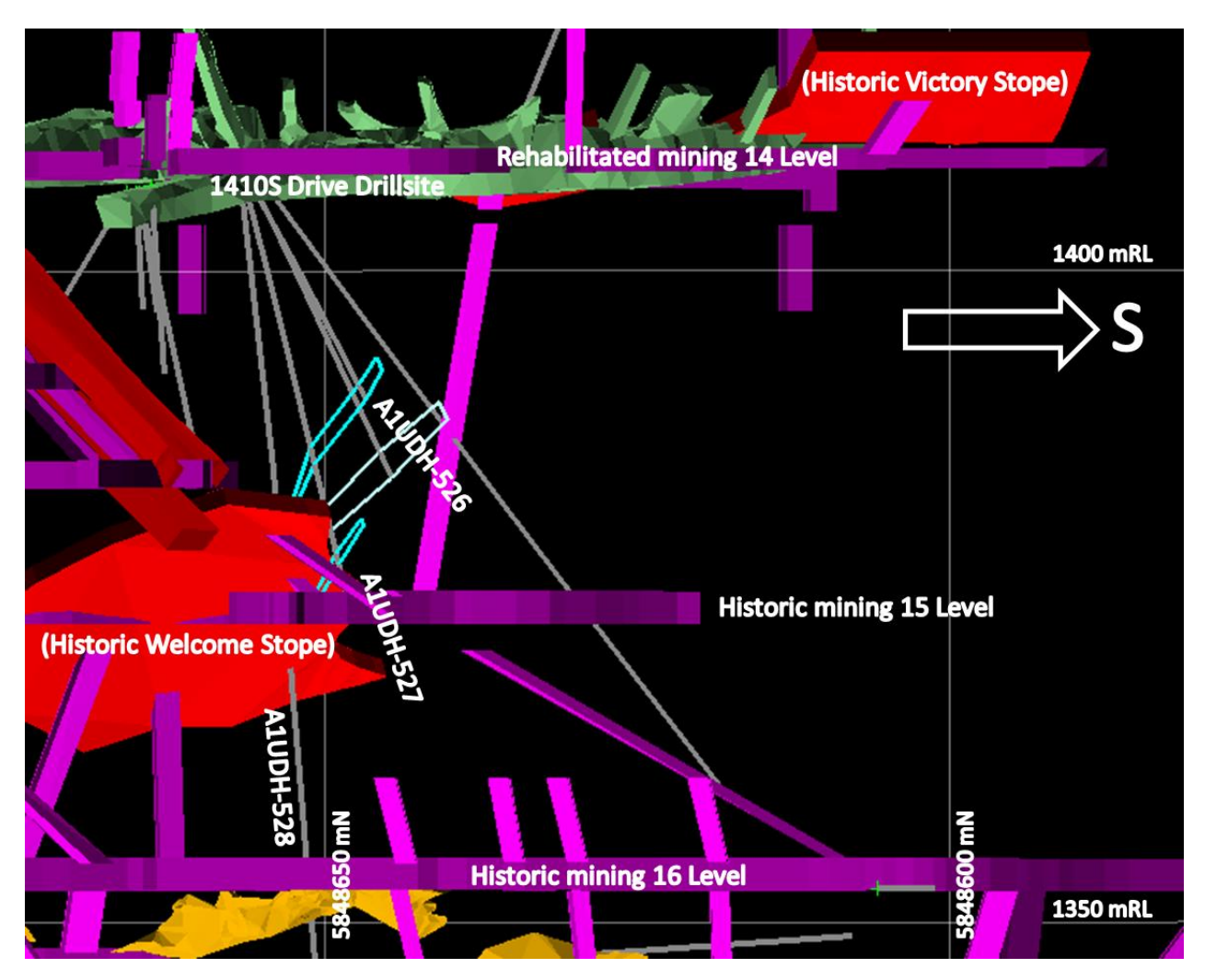
Figure 12: Longitudinal section looking East showing drilling traces (grey), modern drives (green) and the interpreted historic workings (magenta), surveyed historical (amber) and schematic interpretations of historical airleg stoping (red).