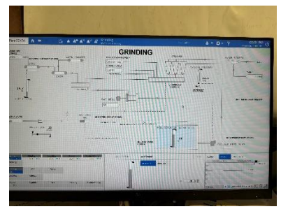
Figure 5. Old PLC