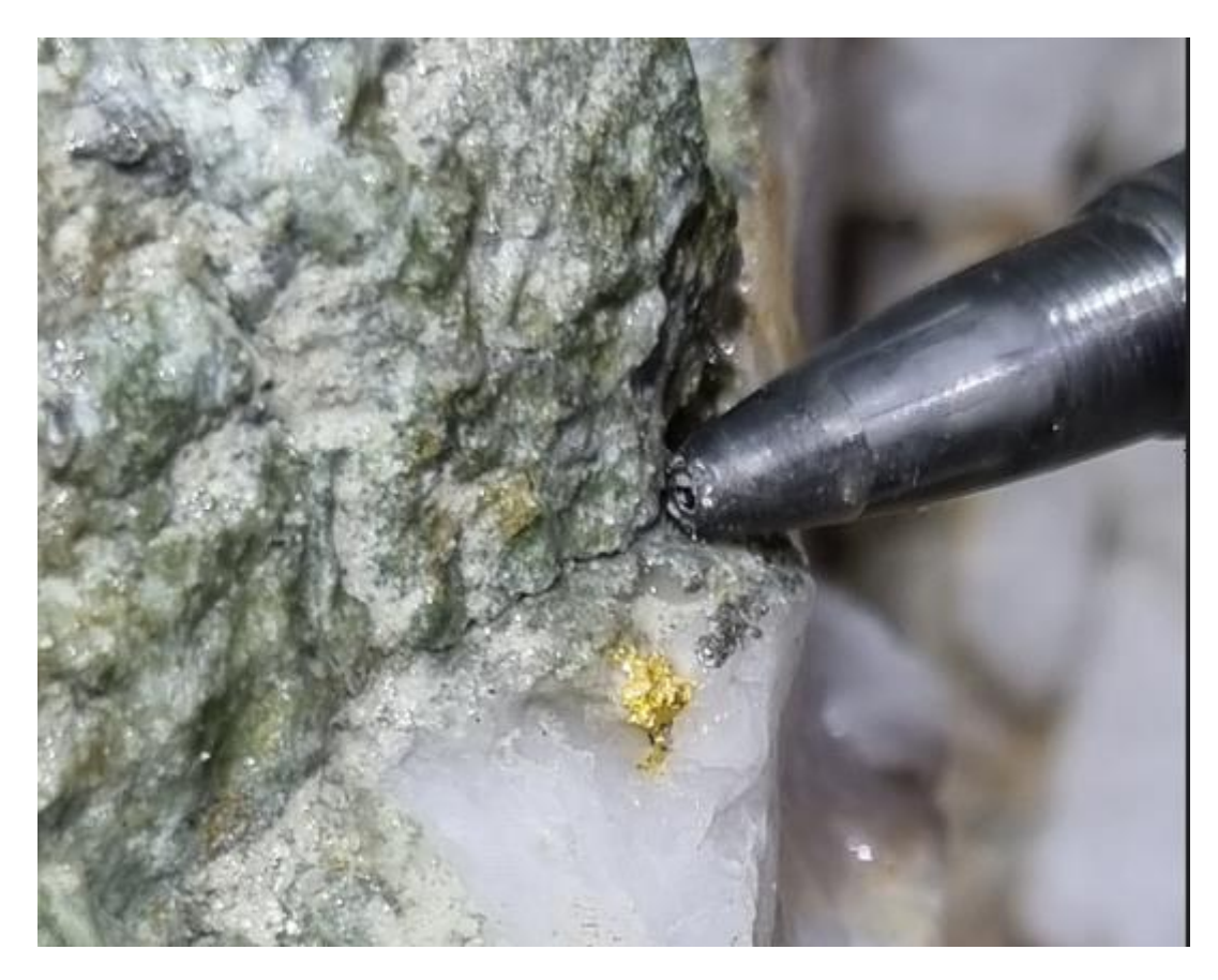
Figure 1: High grade visible gold in the Dukes Reef

The stripping to initiate the breakthrough into the historic 22 Level intersected the Dukes Reef earlier than expected. The Dukes Reef was historically a larger and higher grade reef from a historical production perspective, and its access down dip from the mined upper levels is a welcome and significant development. Visible gold was immediately observed within the Dukes Reef on access (Figure 1).